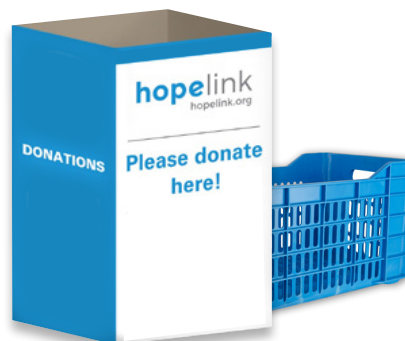
Need sleeves or crates? Contact us to request items.